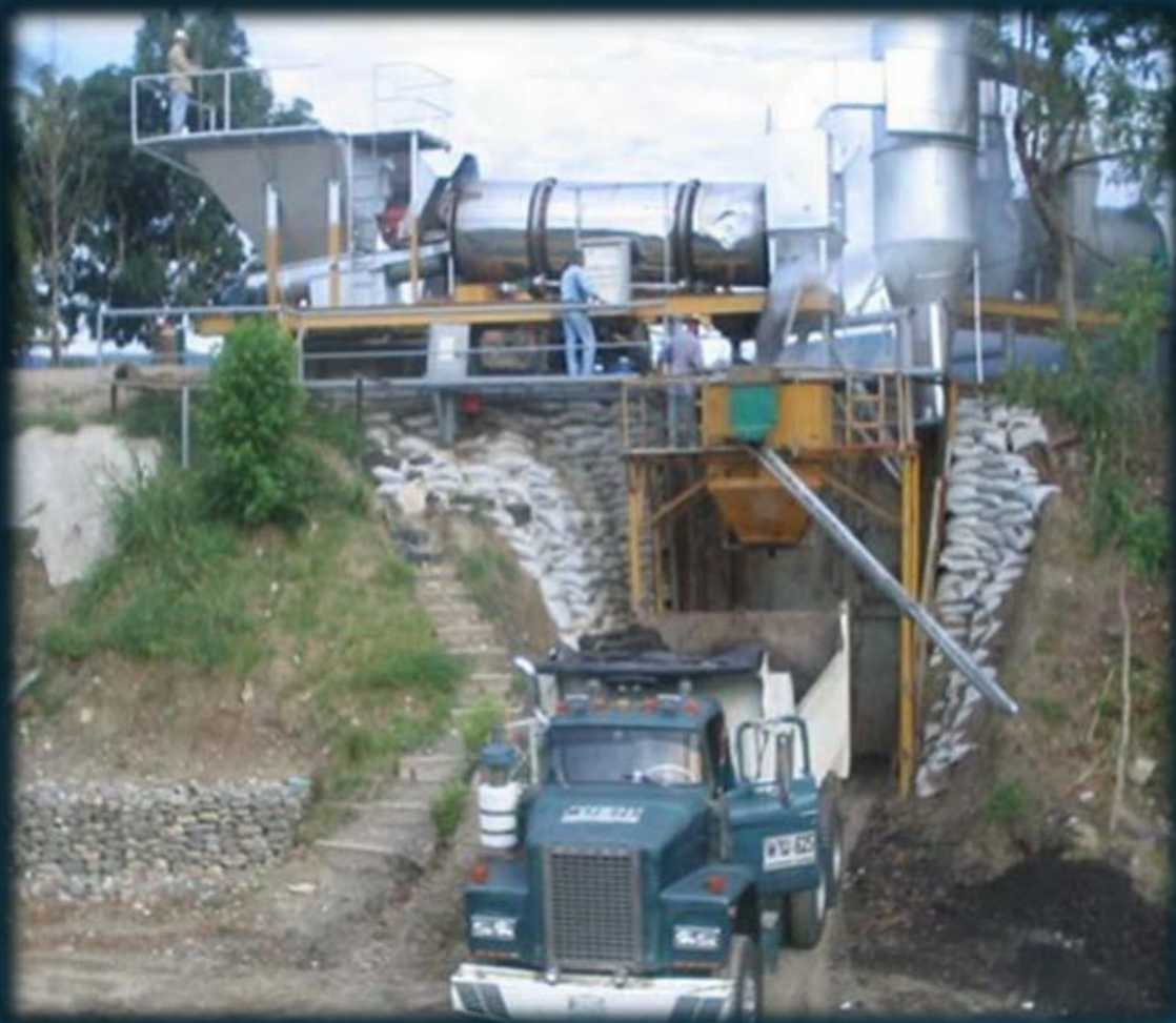
High temperature method